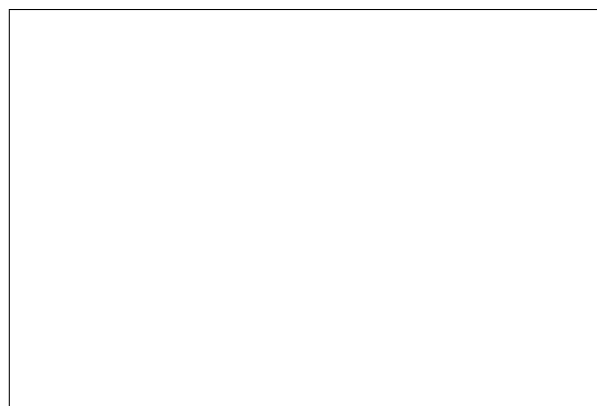
Figure 1. Example of caption. It is set in Roman so that mathematics (always set in Roman: B \sin A = A \sin B ) may be included without an ugly clash.